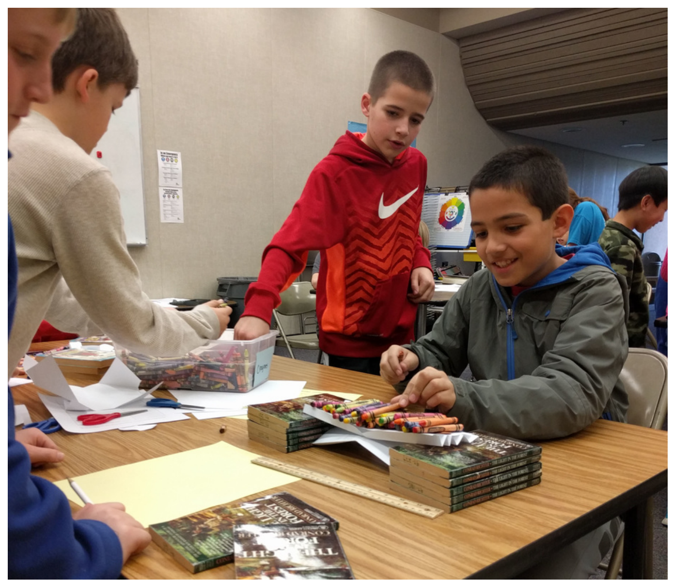
Cleanup Utility For Mac